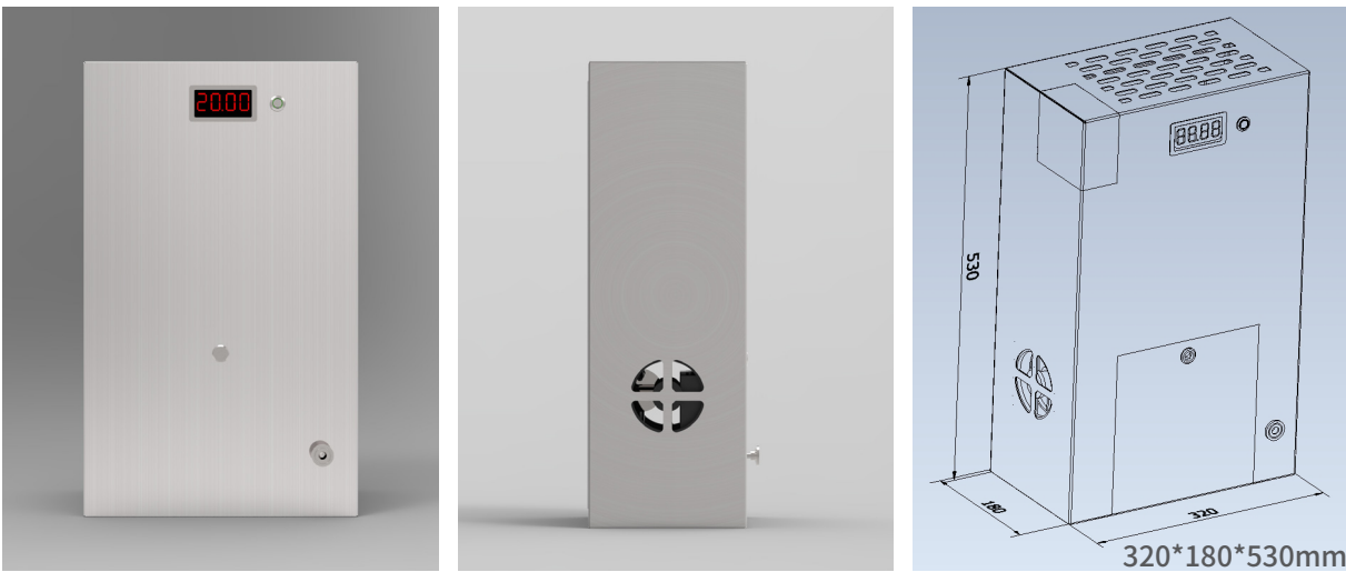
设备整体尺寸 (长宽高尺寸标注) Overall size of device (length, width, height)